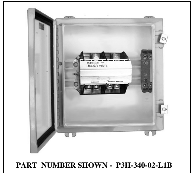
PART NUMBER SHOWN - P3H-340-02-L1B