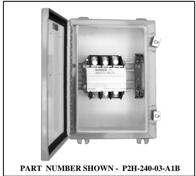
PART NUMBER SHOWN - P2H-240-03-A1B