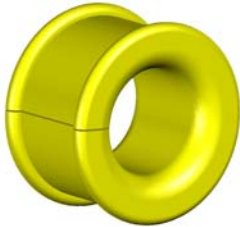
Single Hole Insert