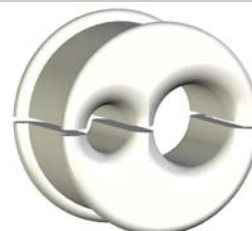
Dual Hole Insert