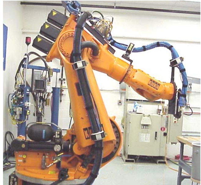
Modified FS dressout on KUKA KR210 with Axis 1 to Axis 3 additional dress