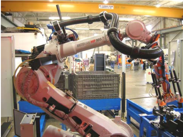
FS70C on a Motoman HP165