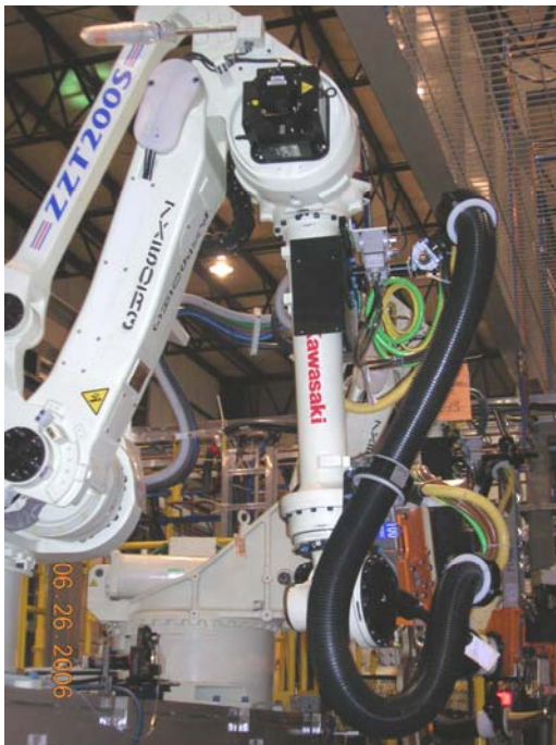
FS95C on a Kawasaki ZZT200S