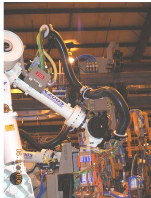
FS95C on a Kawasaki ZX200S

Notice: The information contained herein is, to the best of our knowledge, true, accurate and reliable. Since procedures and conditions under which these products may be used are beyond our control, no warranty, expressed or implied, is made to their performance.